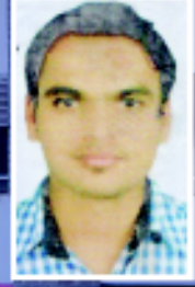
8th Rank Automobile