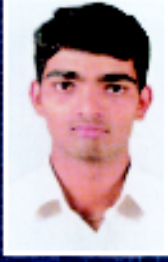
3rd Rank Automobile