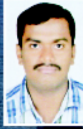
4th Rank Electrical