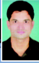
4th Rank Automobile