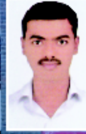
7th Rank Electrical